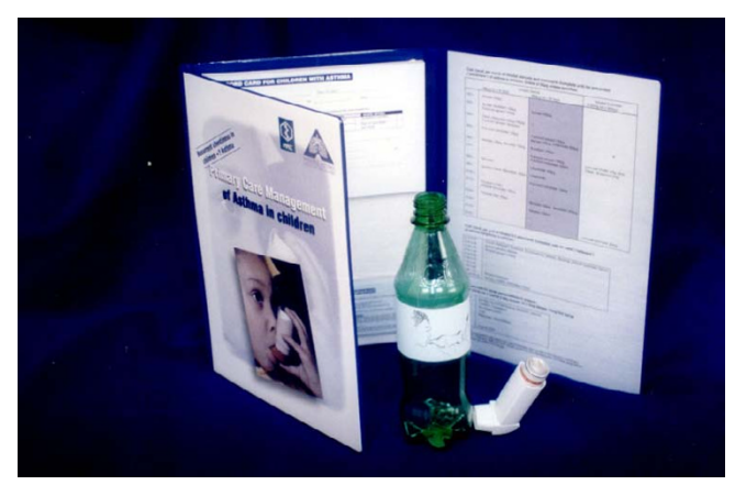
Figure I Support materials left behind for practitioner use.

Private healthcare in Mitchells Plain is usually provided by solo doctors without nurse support operating from storefront practices in the community. There is no formal registration list or roster system, and patients may move between several sources of primary care, including public sector clinics. Payment for private care provided to adults employed in the formal economy and their families is usually made by their employer-based health insurance,